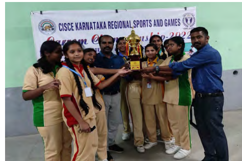
CISCE Regional Sports and Games