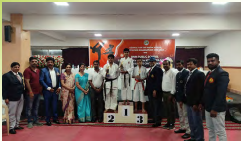
CISCE Regional Sports and Games 2022 Karate Winners