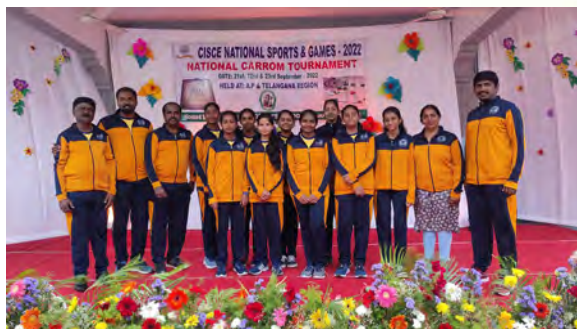
Our Carrom Team which Represented Karnataka at the National Level