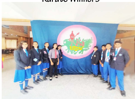
KISA UTSAY Declaration 2nd Prize