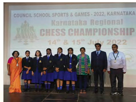
CISCE Karnataka Regional Chess Championship-Runner-up