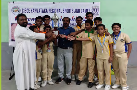
CISCE Regional Sports and Games 2022 Carrom Championship

Overall championship - Topaz and Ruby house Independence day competitions.