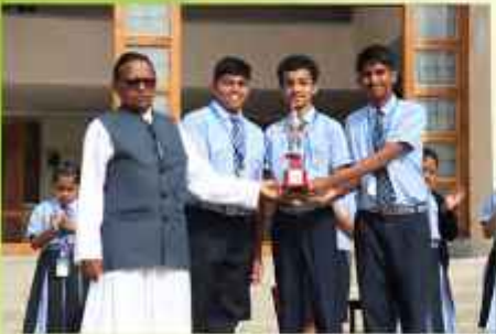
CISCE GAMES AND SPORTS KARATE CHAMPIONSHIP U-19-RUNNER UP