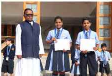
CARROM TOURNAMENT-CISCE GAMES AND SPORTS - 3RD PRIZE