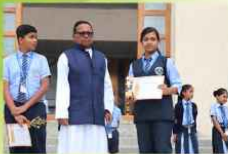
SCIENCE TALK SCIENCE ESSAY-3RD PRIZE