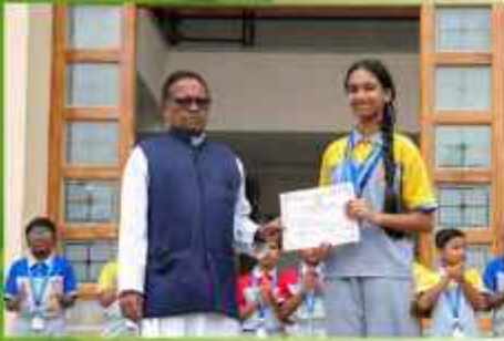
U-19 10 M OPEN SIGHT BY CISCE GAMES AND SPORTS REGIONAL LEVEL-3RD PRIZE