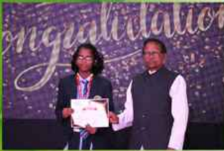
FATHER GEORGE HESS MEMORIAL REGIONAL LITERARY COMPETITION-SUB-JUNIOR-DECLAMA TION-2ND PRIZE