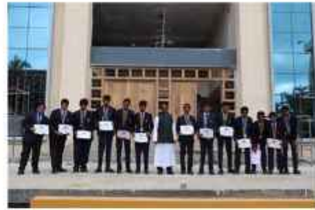
INTER-SCHOOL SPORTS MEET-FOOTBALL SENIOR - 3RD PRIZE