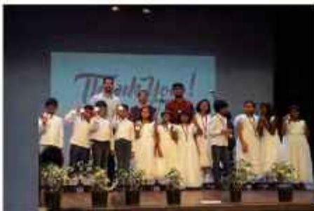
KISA INTER-SCHOOL SINGING COMPETITION-1ST PRIZE