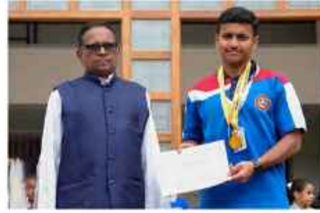
U-19 SKATING BY CISCE GAMES AND SPORTS REGIONAL LEVEL-1ST PRIZE