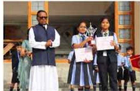
CARROM TOURNAMENT-CISCE GAMES AND SPORTS - 1ST PRIZE