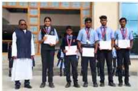
CARROM TOURNAMENT-CISCE GAMES AND SPORTS - 2ND PRIZE