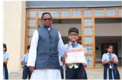
WIZ KIDS CARNIVAL- ALL INDIA KIDS PREMIER LEAGUE -1ST MASTER ORATOR, POEM RECITAL 2ND PRIZE, POEM RECITAL [SEASON -3] 3RD PRIZE