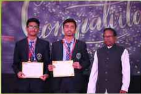
KISA FUTURE BOARD FIESTA-ROBOTICS - 1ST PRIZE