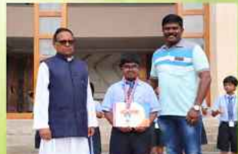
THE ORATIO AN INTER-SCHOOL ELOCUTION COMPETITION -CONSOLATION PRIZE