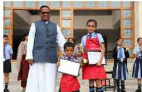
MASTER CHEF JUNIOR-1ST PRIZE