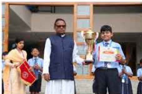
THE ORATIO AN INTER- SCHOOL ELOCUTION COMPETITION -1ST PRIZE