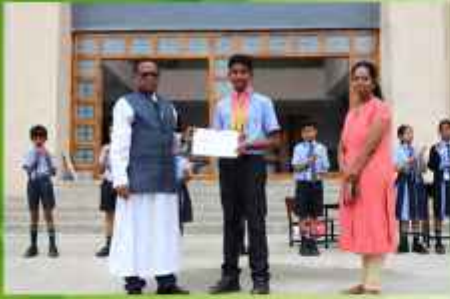
12TH KARNATAKA STATE SHOOTING CHAMPIONSHIP-24 -3 INDIVIDUAL SILVER,4-TEAM SILVER , SUB YOUTH 10 M AIR PISTOL BY INDIAN OPEN COMPETITION GOA-3RD PRIZE