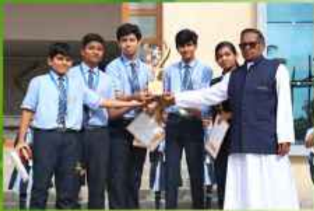
SCIENCE TALK - QUIZ, ESSAY, LECTURE, DEBATE