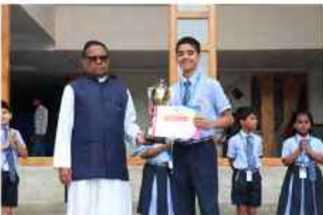
THE ORATIO AN INTER-SCHOOL ELOCUTION COMPETITION -3RD PRIZE