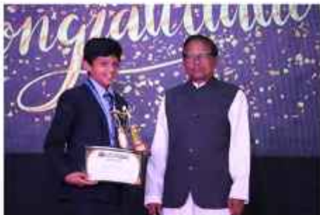
U-13 AND 16 BOYS SINGLES BADMINTON TOURNAMENT-RUNNERS