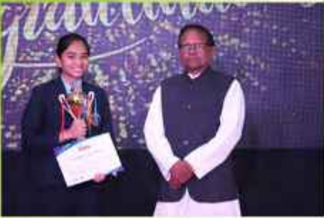
VIVA VIBGYOR CHESS COMPETITION-1ST PRIZE