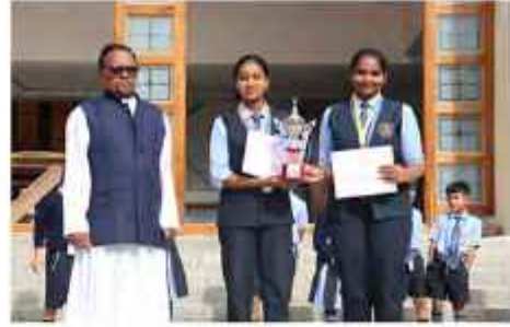
CARROM TOURNAMENT- CISCE GAMES AND SPORTS - 1ST PRIZE