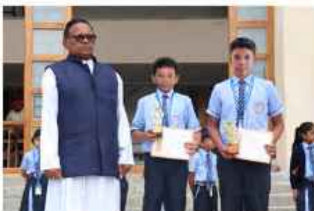
INTER-SCHOOL SWIMMING COMPETITION- 2ND AND 1ST PRIZE