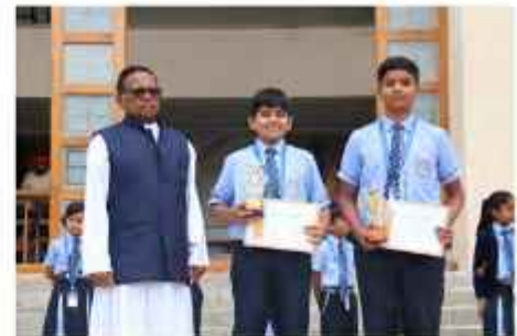
SCIENCE TALK- SCIENCE QUIZ- 2ND PRIZE