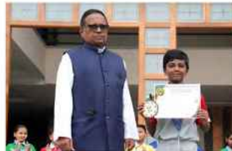
MARTIAL ARTS -SILAMBAM CHAMPIONSHIP -2ND PRIZE