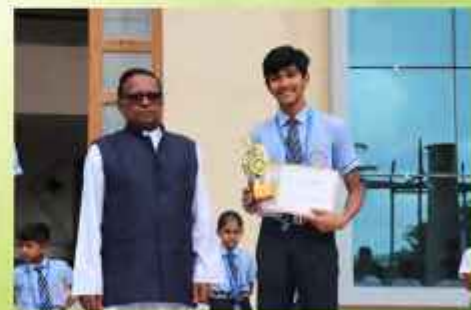
SCIENCE TALK- SCIENCE DEBATE-1ST PRIZE