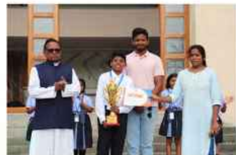
THE ORATIO AN INTER-SCHOOL ELOCUTION COMPETITION -1ST PRIZE