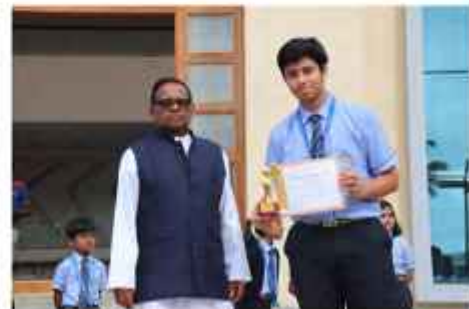
SCIENCE TALK SCIENCE LECTURE-3RD PRIZE