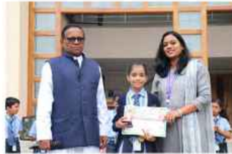
STATE LEVEL OPEN YOGASANA CHAMPIONSHIP-5TH PRIZE