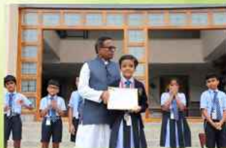
KISA CREATIVE WRITING-2ND PRIZE